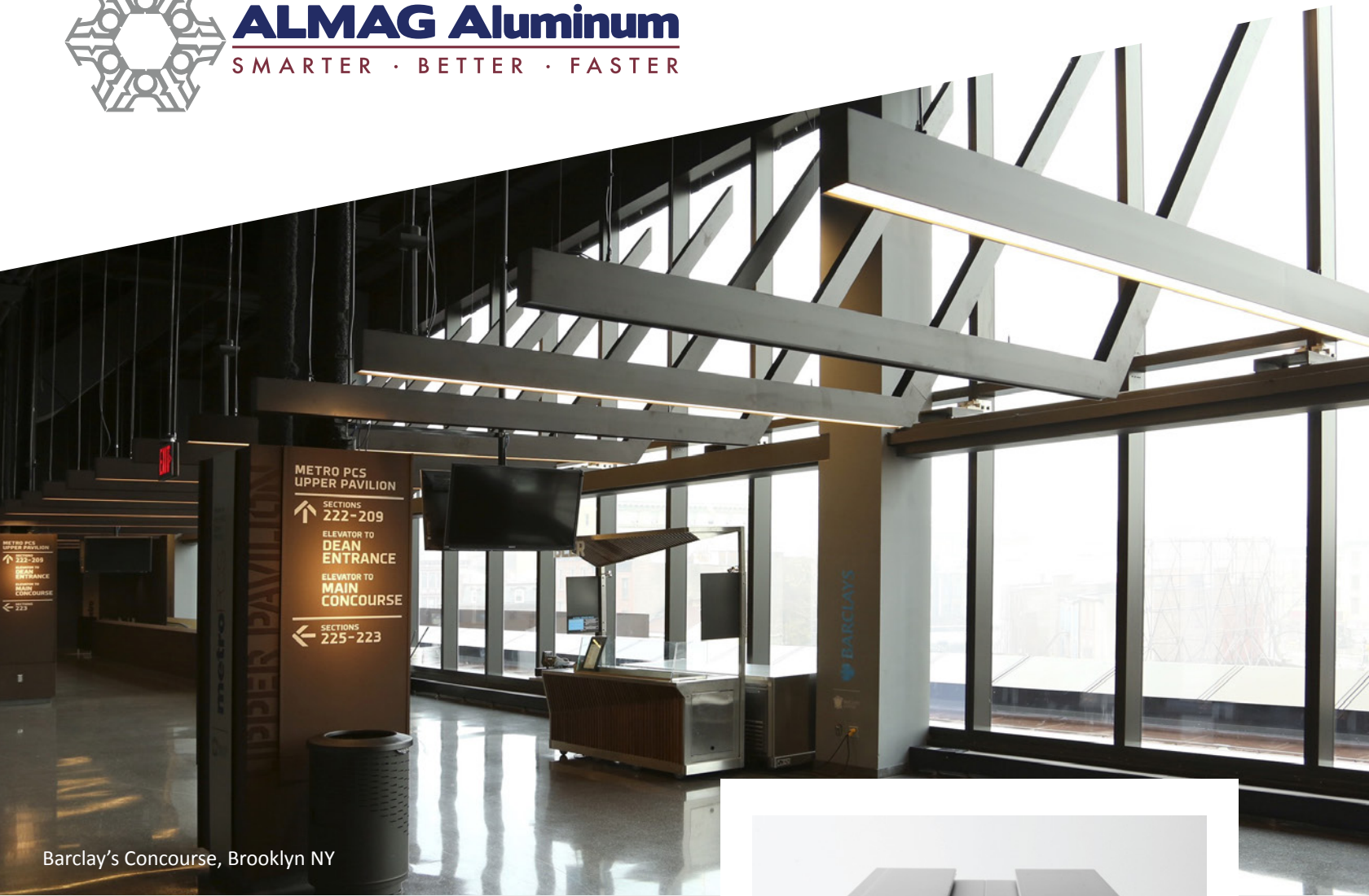
Barclay's Concourse, Brooklyn NY

ALMAG Aluminum SMARTER · BETTER · FASTER